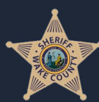
Wake County PD